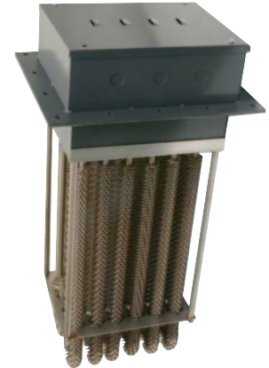
Finned Duct Heater

D Standard field replaceable elements are held in place with single-screw quick-release "V" clamps. Pressure resistant designs utilizing welded elements, bulkhead fittings, or compression fittings to attach elements to the flange are available to limit leakage of ducted air or gases into the terminal enclosure. Welded elements are used for gas tight applications.